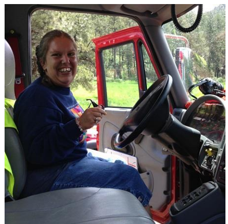
In the driver's seat