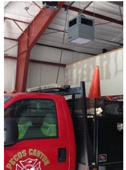
One of the three new exhaust fans which have been installed in the PCFR station.

BE SURE TO HAVE YOUR CHIMNEY AND HEATING SYSTEMS CHECKED AND SERVICED BY A QUALIFIED COMPANY. THIS IS THE TIME OF YEAR THAT NEGLECTING TO HAVE THIS WORK DONE CAN INCREASE CHANCES OF HAVING A HOUSE FIRE.